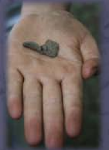
Example of a gun trigger uncovered at Fort St. Joseph.