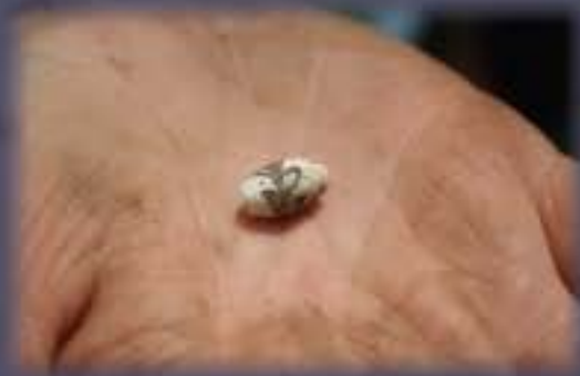
Beads are a common trade item found at Fort St. Joseph.

St. Joseph ranked fourth in volume of furs traded among all posts in New France. It would have seen its population more than double during good weather when the voyageurs and Native Americans engaged in the trade used the post as a base while they carried out their work. Evidence of the fort's role as a trading post abounds in the archaeological record. Glass trade beads are one of the most commonly recovered artifacts. Numerous lead bale seals -- tags that would have marked the contents, origins, or destinations of bundles of goods -- have also been recovered as have baling needles used to bind furs together for transport. A gunsmith's cache of spare gun parts points not only to military activity, but to commercial activity as gun repair was one of the services that the French provided to their Native American allies to whom they traded flintlock muskets.