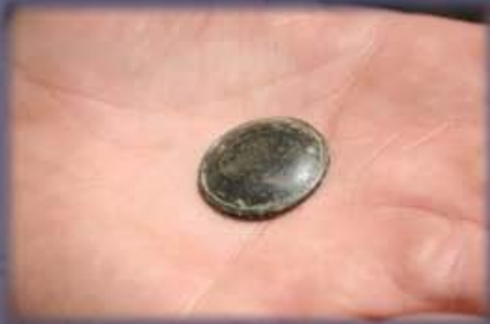
A French Marine button uncovered at Fort St. Joseph, indicating the French military presence at the fort.

The military presence at the fort normally consisted of a commandant and 8 to 10 enlisted men. Several French Marine uniform buttons have been uncovered during archaeological excavations as well as an entire cache of gun parts (part of a gunsmith's repair kit), some of which likely belonged to flintlocks of military issue. These items give tangible evidence of the soldiers, beyond the official documents that recorded their presence at Fort St. Joseph. British soldiers occupied the fort from 1761 until Pontiac's Rebellion in 1763 when supporters of the Ottawa leader attacked and occupied Fort St. Joseph in order to force the British from the area and encourage the return of the French. The fort was not regarrisoned by the British after this episode until a brief occupation in 1779. Material evidence of the British military consists of a ramrod