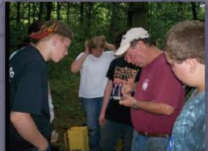
Summer campers excavate alongside project archaeologists.

along with project archaeologists. Members of the project also work to spread knowledge of Fort St. Joseph. Project archaeologists present fort history and our public archaeology program at various conferences. Recently, presentations were given at Williamsburg, St. Louis, Albuquerque, Québec, Vancouver, Puerto Rico and La Rochelle, France, as well as throughout Michigan and the Midwest. Integrating community service learning into the field school makes Fort St. Joseph archaeology a unique project.