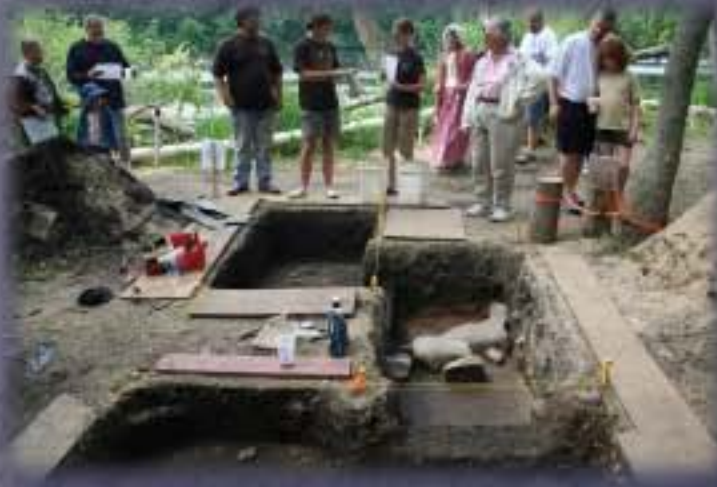
WMU archaeologists speak to visitors at the 2007 Open House.

interested in learning more about archaeology and French Colonial life. An Open House weekend at the site invites the public to tour the site, interact with archaeologists and learn more about the history of the fort and the project. Past open houses have featured an outdoor museum, a French Colonial village, tours of the site provided by project archaeologists and other activities. Week long summer camps for students, adults and teachers are also offered through the Fort St. Joseph Museum. During the camps, students learn about archaeology and get to excavate right