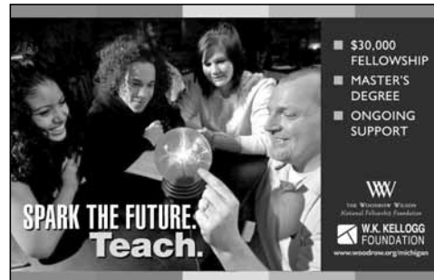
Woodrow Wilson teaching fellowship advertisement

Fellows will attend an enriched, school-based master's-level teacher education program. Throughout the program, their coursework will be blended with teaching experiences completed alongside a master teacher in a high-need middle or high school classroom.