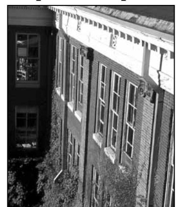
East Hall, WMU's first building