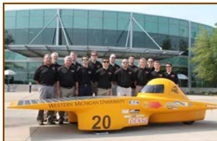
2012 Sunseeker Team

It is no surprise that the Sunseeker team won the 2012 Solar Race Sportsmanship Award. After helping out fellow competitors, the Sunseeker team received the 2012 Solar Race Sportsmanship Award. Surprised? Not at all. The team has the reputation for sharing their own race related issues and how they address them to benefit other teams that may run into the same problems. For more on the award, visit MyWMU.com for the full story. The Sunseeker team finished the race earning the 8th place spot. Originally, there were 16 cars that qualified from around the world, and of those only 11 were able to finish the more than 1,600-mile course and make checkpoint stops and mandatory overnight stays along the route. To follow the race from start to finish and all related articles visit: http://www.wmich.edu/news/2012/07/1070