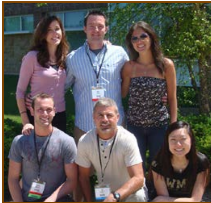
First year Physician Assistant students and faculty who attended the annual AAPA Conference in Toronto, Ontario