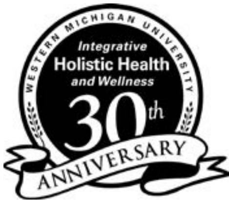
Holistic Health Care program 30th Anniversary event October 20, 5 to 7:30 p.m. at the Health and Human Services building