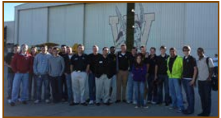
Great day for a chapter meet up with Eastern Michigan University at the pancake Fly-in!

On September 15, 2012, WMU students, faculty and staff, along with the community, enjoyed flying pancakes in the hangar at the College of Aviation. Over 250 guests were enthusiastically served by Chris Cakes. Guests also enjoyed the opportunity to visit with the 15 pilots who flew their aircraft into the college specifically for the event. One college Registered Student Organization, Alpha Eta Rho, also used the breakfast as an opportunity to meet the Eastern Michigan University chapter by inviting them to come to WMU to participate in the event. The timing of the event coincided conveniently with Governor Snyder's declaration that September 2012 is Michigan Aviation Month.