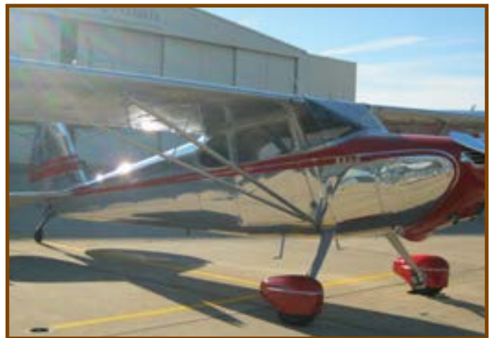
One of 15 aircraft who participated in the breakfast.

On September 15, 2012, WMU students, faculty and staff, along with the community, enjoyed flying pancakes in the hangar at the College of Aviation. Over 250 guests were enthusiastically served by Chris Cakes. Guests also enjoyed the opportunity to visit with the 15 pilots who flew their aircraft into the college specifically for the event. One college Registered Student Organization, Alpha Eta Rho, also used the breakfast as an opportunity to meet the Eastern Michigan University chapter by inviting them to come to WMU to participate in the event. The timing of the event coincided conveniently with Governor Snyder's declaration that September 2012 is Michigan Aviation Month.