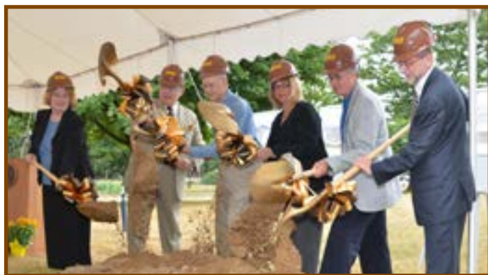
Leaders of WMU break ground for the new Legacy Collections Center July 19