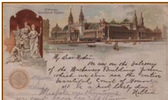
Postcard of WMU Archives and Regional History Collections from Columbian Exposition