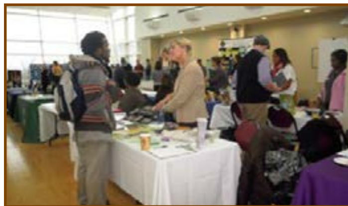
Information exchanged at Field Placement and Career Social Services Day

On Friday, Jan. 11, the College of Health and Human Services hosted Field Placement and Career Social Services Day, an event co-sponsored by MRC Industries, the WMU School of Social Work, and WMU Career and Student Employment Services. From 10 a.m. until 12:30 p.m. that day, recent graduates and students majoring in areas such as social work, mental health, and social science gathered to discuss careers and internships with a number of community organizations representing those fields.