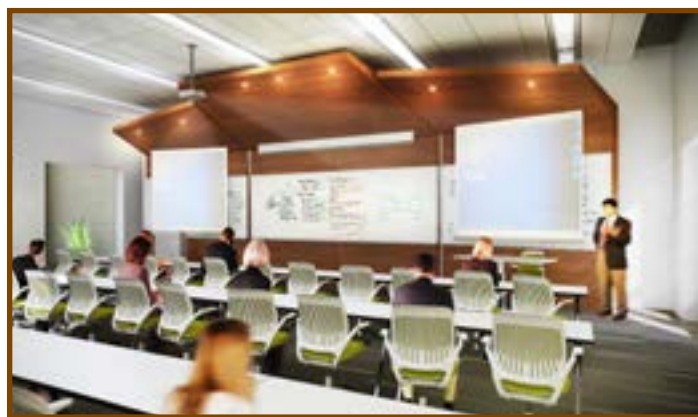
Phase II of Zhang Legacy Collections Center configured for a guest scholar