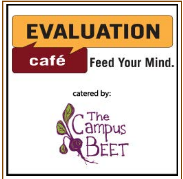
The Campus Beet now catering

Make sure to check out our spring Evaluation Café schedule, which is now posted at www.wmich.edu/evalctr/evaluation-cafe/upcoming-events . The Campus Beet will be catering every other Evaluation Café this spring.