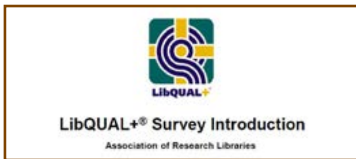
Libraries request student, faculty, and staff input through this survey