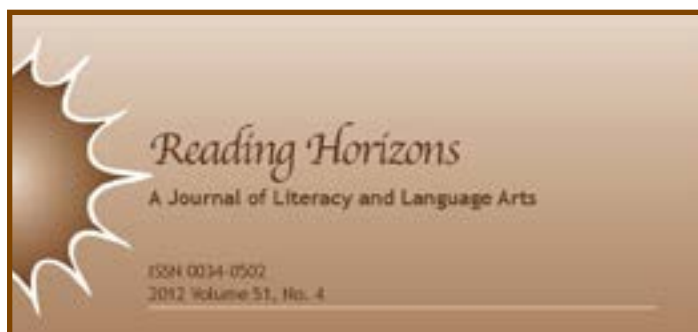
Over 50 years of this journal are now available in Libraries digital database

203 issues with 1,631 articles. The Digitization Center at University Libraries digitized all the back issues and ScholarWorks staff processed and uploaded all the articles by September 2012. It was the most downloaded group of articles in ScholarWorks with 90,800 downloads in 2012. A 2008 article on differentiated reading instruction is the second most popular article in ScholarWorks with 7,287 downloads last year. Five other articles have received over 1,000 downloads. The home page for the journal is here: http://scholarworks.wmich.edu/reading_horizons/ . The digitization of the "Reading Horizons" back issues and their placement in the ScholarWorks open-access repository fulfills one of ScholarWorks' goals: to increase the visibility and access to WMU's scholarly work worldwide. To find out more, browse the ScholarWorks repository by department or unit, author, discipline (subject) or take a look at the journals currently online at ScholarWorks http://scholarworks.wmich.edu/ . Please contact Maira Bundza maira.bundza@wmich.edu with potential projects or questions.