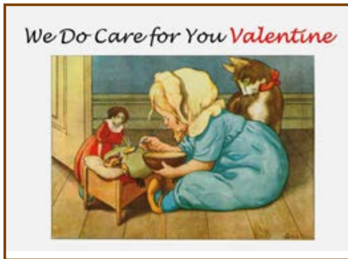
University Libraries Valentine exemplifies the resources of our Special Collections Department and Digitization Center