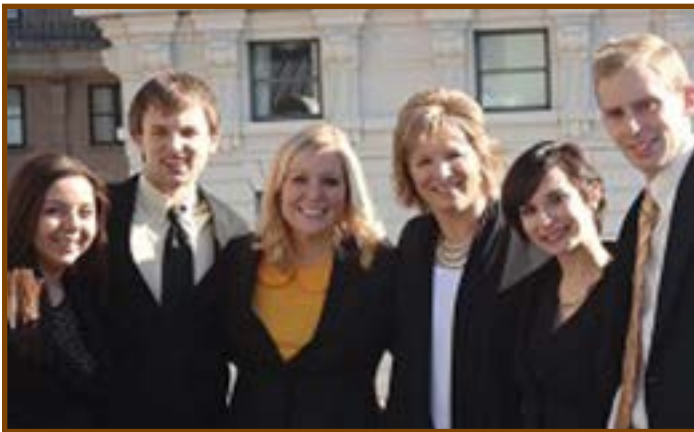
Part of the team