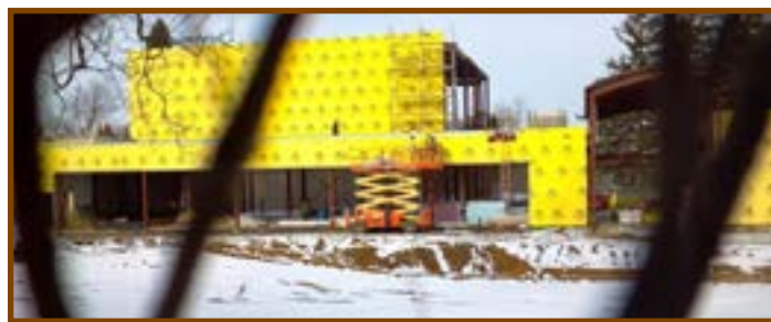
Zhang Legacy Collections Center takes shape during February

Progress continues on the "Zhang Legacy Collections Center" on Oakland Drive. Girders rose up to the grey skies in December. Then a fir tree topped off the heights protecting the construction site from mean trolls and forest spirits (according to Nordic legend). In spite of the snow and cold weather a 10-inch concrete layer was poured in January. A gigantic heating blanket seasoned the base for the 30 plus foot high book stacks. High-bay mobile shelving will glide over this floor once guide wires, railing, and 3 more inches of concrete are installed. In the pink of Valentine's Day activities, yellow framing materials could be seen from Oakland Drive filling in the superstructure. The walls glowed in the cold sunlight. Progress has been achieved, most assuredly, with an anticipated completion in early October. Perhaps the grand opening will occur as an open-house event for Homecoming (yet TBA)!