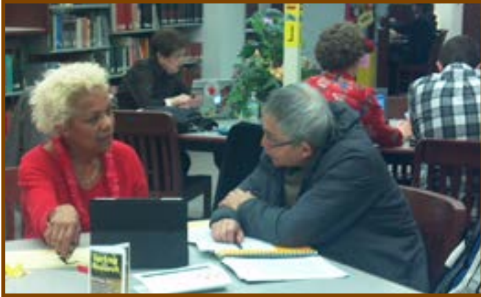
Individual consultations are the focus of the "Spring Into Research" event

the event with a generous supply of popcorn. Future student outreach events are being explored by University Libraries so that student researchers understand and use materials and personnel throughout the University Library system.