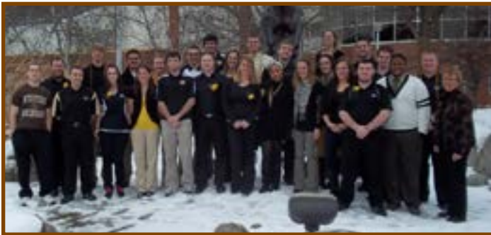
Phi Epsilon Kappa Spring Initiation