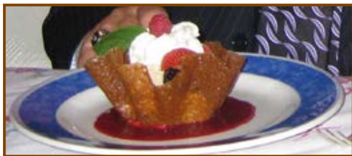
New Collection of culinary books will be available at University Libraries