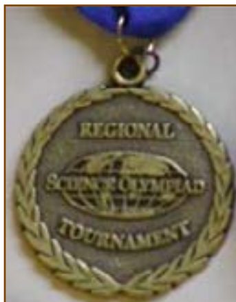
Science Olympiad Award

Over 400 middle and high school students from Allegan, Barry, Branch, Calhoun, and Kalamazoo counties will gather for the Region 10 Science Olympiad competition Saturday, March 16, at Western Michigan University. The competition will run from 8 a.m. to 3:30 p.m. in various campus locations, with the awards ceremony from 4 to 5 p.m. in the