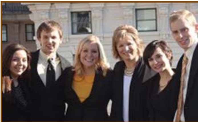
Part of the team