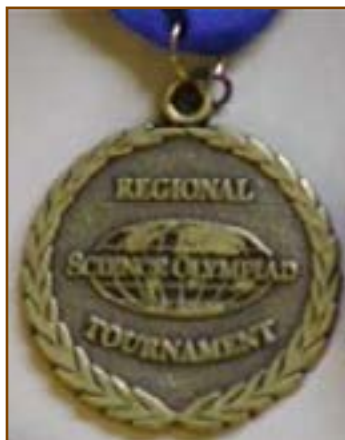
Science Olympiad Award

Over 400 middle and high school students from Allegan, Barry, Branch, Calhoun, and Kalamazoo counties will gather for the Region 10 Science Olympiad competition Saturday, March 16, at Western Michigan University. The competition will run from 8 a.m. to 3:30 p.m. in various campus locations, with the awards ceremony from 4 to 5 p.m. in the