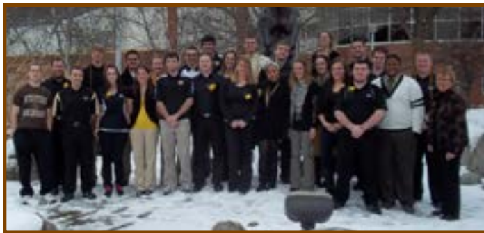
Phi Epsilon Kappa Spring Initiation