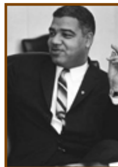
Whitney Young Jr., 1964