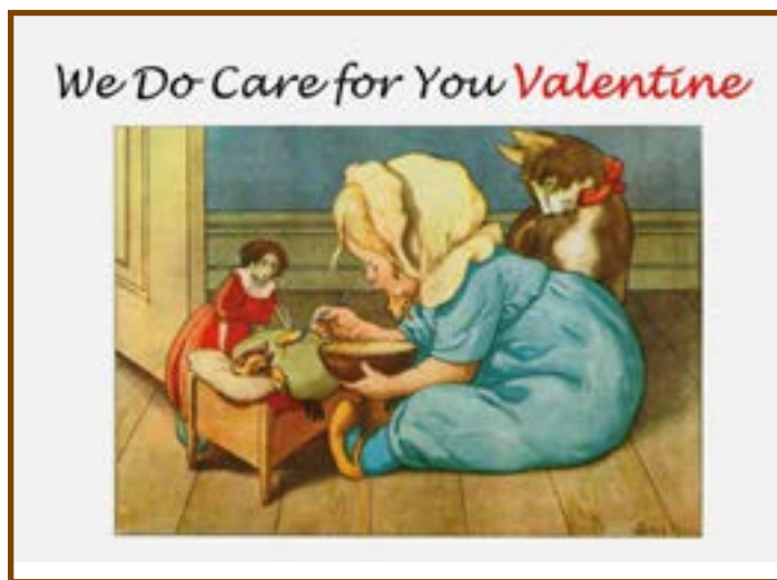
University Libraries Valentine exemplifies the resources of our Special Collections Department and Digitization Center