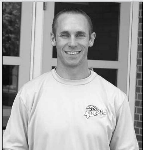
HELPING ATHLETES IS HIS STRONG SUIT