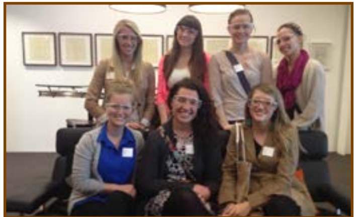
Interior design students tour Herman Miller corporate headquarters