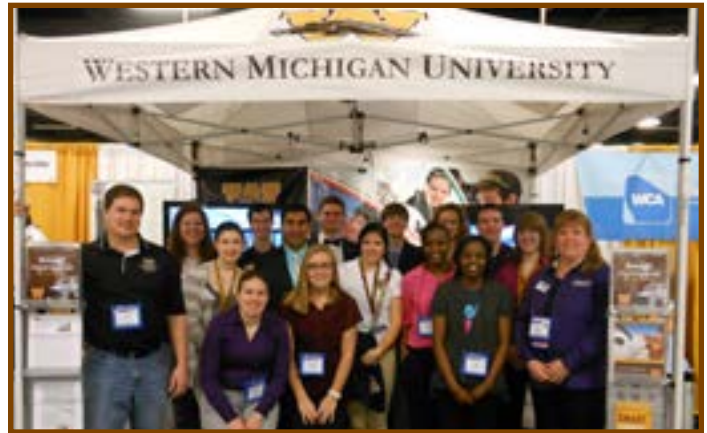
Faculty, staff, and students representing WMU