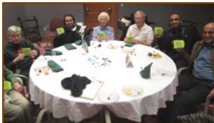
WMU CELCIS students with residents of Friendship Village