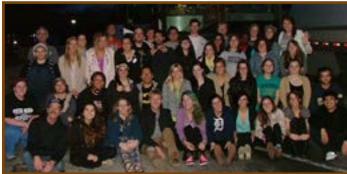
Students from the Frostic School of Art Sculpture Area tour galleries in Upstate New York