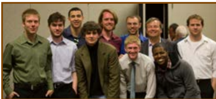
WMU School of Music's Advanced Jazz Ensemble