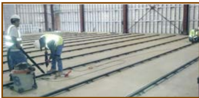
The Archives and Regional History Collections new "home" in the Zhang Legacy Collections Center is coming together with high bay shelving rail installation this month.

materials from Storage using the present process even though these materials in Storage (North Hall) will be processed through our Resource Sharing Department beginning April 29, 2013, and extend through the facility relocation period. The relocation period is expected to be completed in mid-October 2013. Please consult with interlibrary loan at Waldo Library as early as possible for additional information if you may need materials during this period or use this email: lib-rsc@wmich.edu .