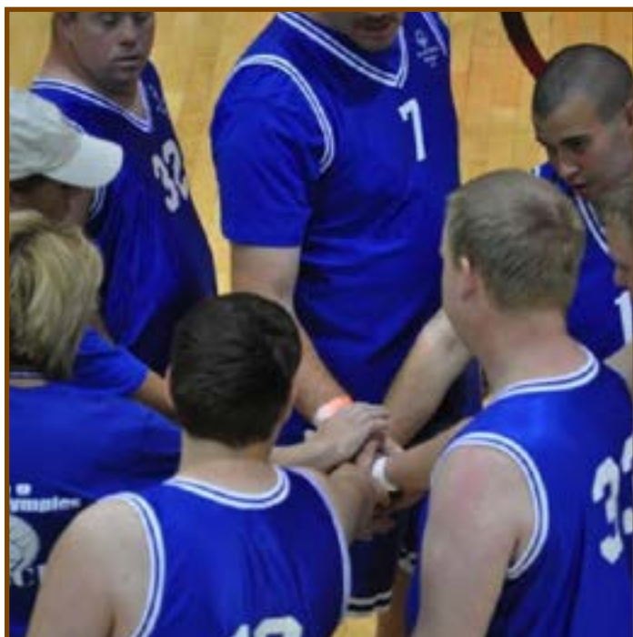
2013 Special Olympics Teamwork