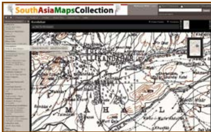
Afghanistan map in the Libraries fully featured user interface: South Asia Maps Collection

viewed here: http://www.wmich.edu/library/collections/digital/collections . Faculty and staff are encouraged to submit requests for custom digitized collections and projects that utilize the technology and the expertise of staff at University Libraries.