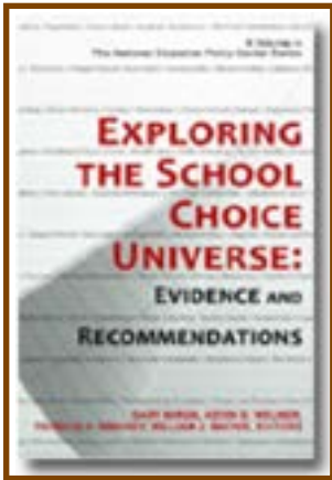
Exploring the School Choice Universe: Evidence and Recommendations

program was established in 2006 to recruit outstanding industrial and technical education professionals to teach at the summer institute.