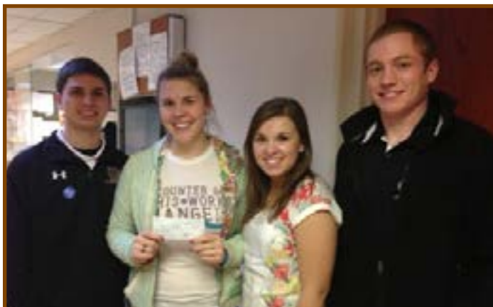
SPASM sponsors fundraiser for Athletic Training Alum