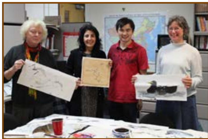
Participants in the water color painting culture class show off their work.

The Confucius Institute at WMU will host a wide variety of cultural activities and camps this summer: language camps for Chinese language students at Portage Public Schools; cultural activities for Portage Public Schools Chinese language students - China Summer Festival and a trip to Chicago's Chinatown for a