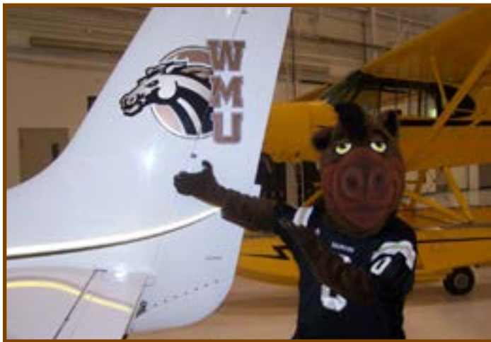
Buster loves the College of Aviation!

Two nationally recognized aviation organizations, Western Michigan University's College of Aviation and the Air Zoo, partner for a week of educational experiences, designed for kids ages 14-17. The summer camp includes enhancing leadership skills, piloting the advanced WMU Cirrus SR-20 and simulation devices, speakers from the industry, hands-on aircraft maintenance, and social activities. Beginning Sunday, June 23, students will enjoy a week full of science exploration during the WMU/Air Zoo's summer camp experience. Our professional educators will share the thrill of aviation and space with campers through hands-on activities and interactive experiments. Campers will get an in-depth look at WMU's College of Aviation and the Air Zoo, including the 4D theater, full-motion flight simulators and much more! This camp includes five nights of accommodations in the WMU residence halls; all meals and snacks; entrance fees into all activities and parks; linen packet; ground transportation to all activities and events (no vehicle required); all flight and simulator fees; and instructional time. Cost is $1,250 for the week. To register for this camp, visit www.wmich.edu/aviation or call (269) 964-7846. Please note students in this camp will not receive an Air Zoo T-shirt, pizza party, or 10% discount.