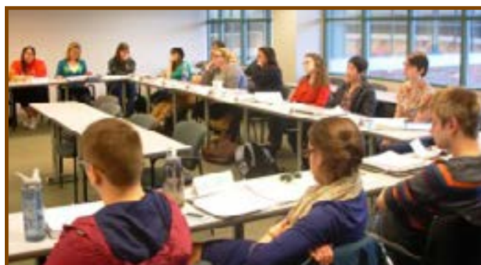
Student of the School of Public Affairs and Administration deliberating grant proposals