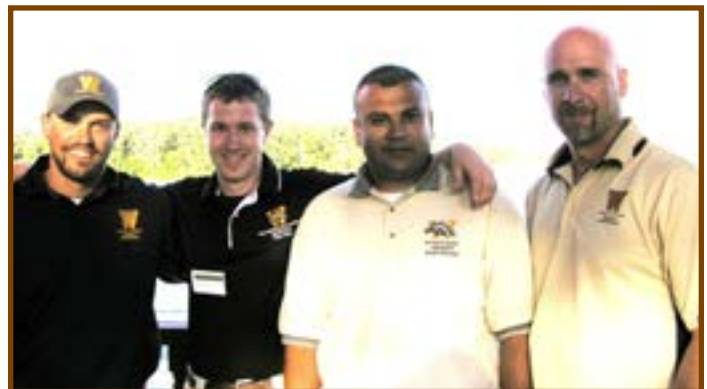
Staff and students golfing together