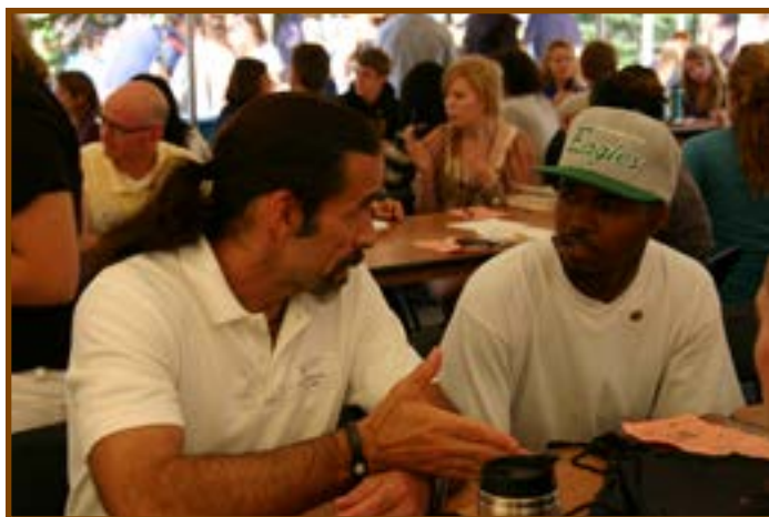
Fall Welcome Pizza with the Profs