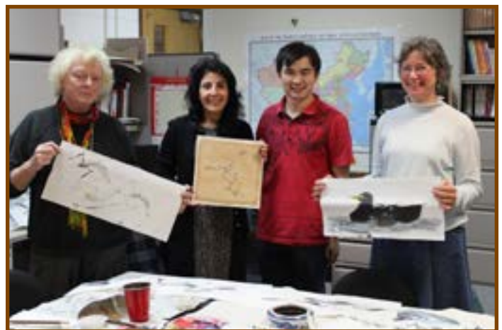
Participants in the water color painting culture class show off their work.

The Confucius Institute at WMU will host a wide variety of cultural activities and camps this summer: language camps for Chinese language students at Portage Public Schools; cultural activities for Portage Public Schools Chinese language students - China Summer Festival and a trip to Chicago's Chinatown for a