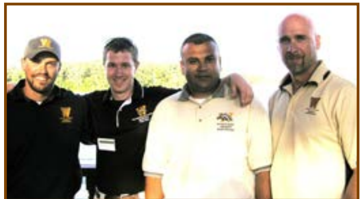
Staff and students golfing together