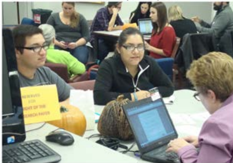
Four Research Clinics this semester for students at Waldo

Supplemental help for research and writing projects are offered spring semester 2014: Research and writing clinics at Waldo Library will give students individual help with their projects and papers. They will be on four different Tuesday nights, 3 to 7 p.m. on Jan. 28, Feb. 18, March 11, and April 1 in Waldo Library.