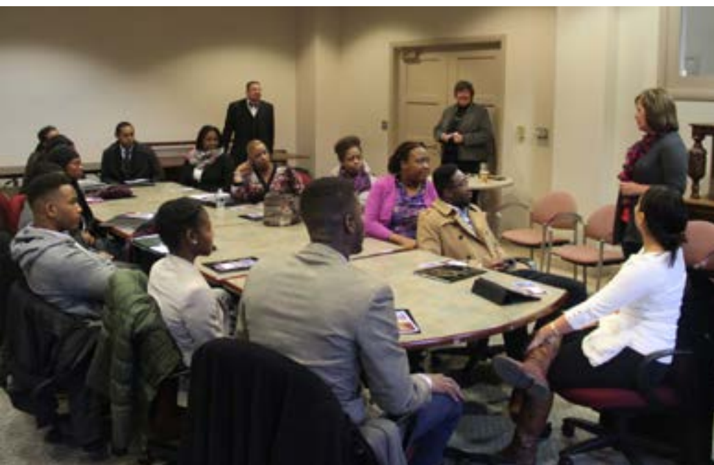
Prospective students meet with Graduate College staff.