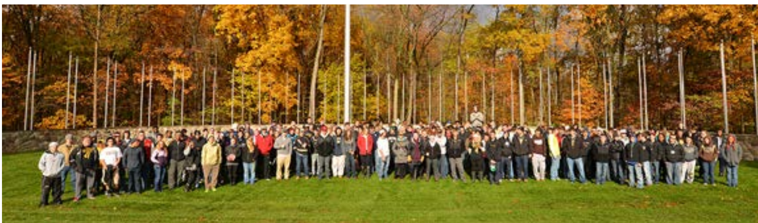
The group of first-year business students at Fort Custer National Cemetery.

On Nov. 2, 2013, a group of more than 300 first-year business students participated in a community service project at Fort Custer National Cemetery in Augusta, MI, where they cleaned the headstones of more than 5,000 graves as part of the cemetery's preparations for Veterans Day. The project took place as part of the business college's First Year Experience activities. The group represented 14 sections of the college's FYE 2100 course, and 11 instructors led students in the project.