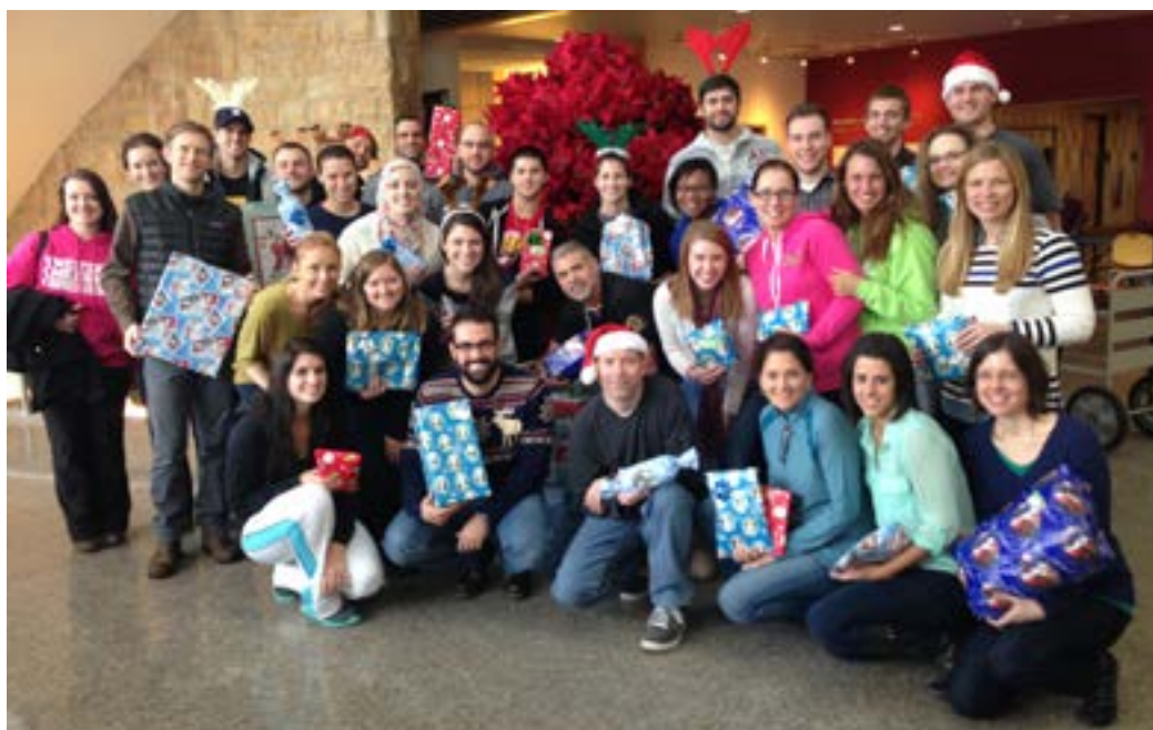
Physician Assistant students with donations for their "Adopted Family."

WMU physician assistant students were again active in community service late last year. They participated in the "Adopt a Family" program sponsored by the Catholic Charities Diocese of Kalamazoo, collecting monetary donations for clothing, non-perishable foods, personal care products, and Christmas gifts for a mother, grandmother and four-year-old twins. PA students and faculty also participated in the annual Run Through the Lights 5K run/walk in downtown Kalamazoo. A record number of about 1,500 runners registered for the 2013 event, which is hosted by Gazelle Sports and the Kalamazoo Area Runners annually. Donations of non-perishable food items and monetary contributions were accepted and went to Kalamazoo Loaves and Fishes. Both events were successful and rewarding to students and those who benefitted from related contributions. PA students and faculty hope to participate in these events again in 2014.