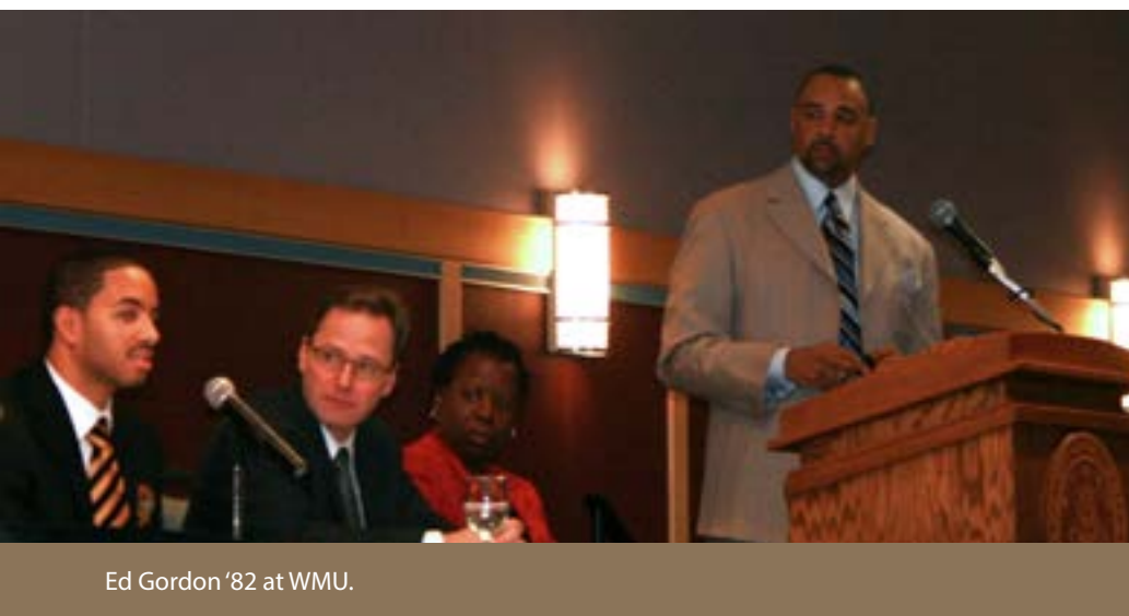
Ed Gordon '82 at WMU.

Communication and political science graduate Ed Gordon ('82) returned to campus on Monday, Dec. 2, to mark the 50th anniversary of Dr. Martin Luther King, Jr.'s visit to Western Michigan University. Gordon, an Emmy-award-winning journalist, has been the host and contributor of various news programs, including BET News, BET Tonight, NPR's News and Notes and most recently, Weekly with Ed Gordon.