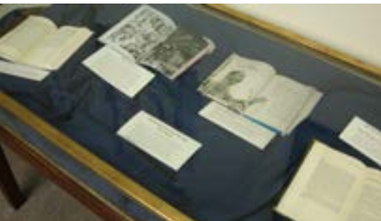
Martin Luther King, Jr. display in Waldo Rare Book Room