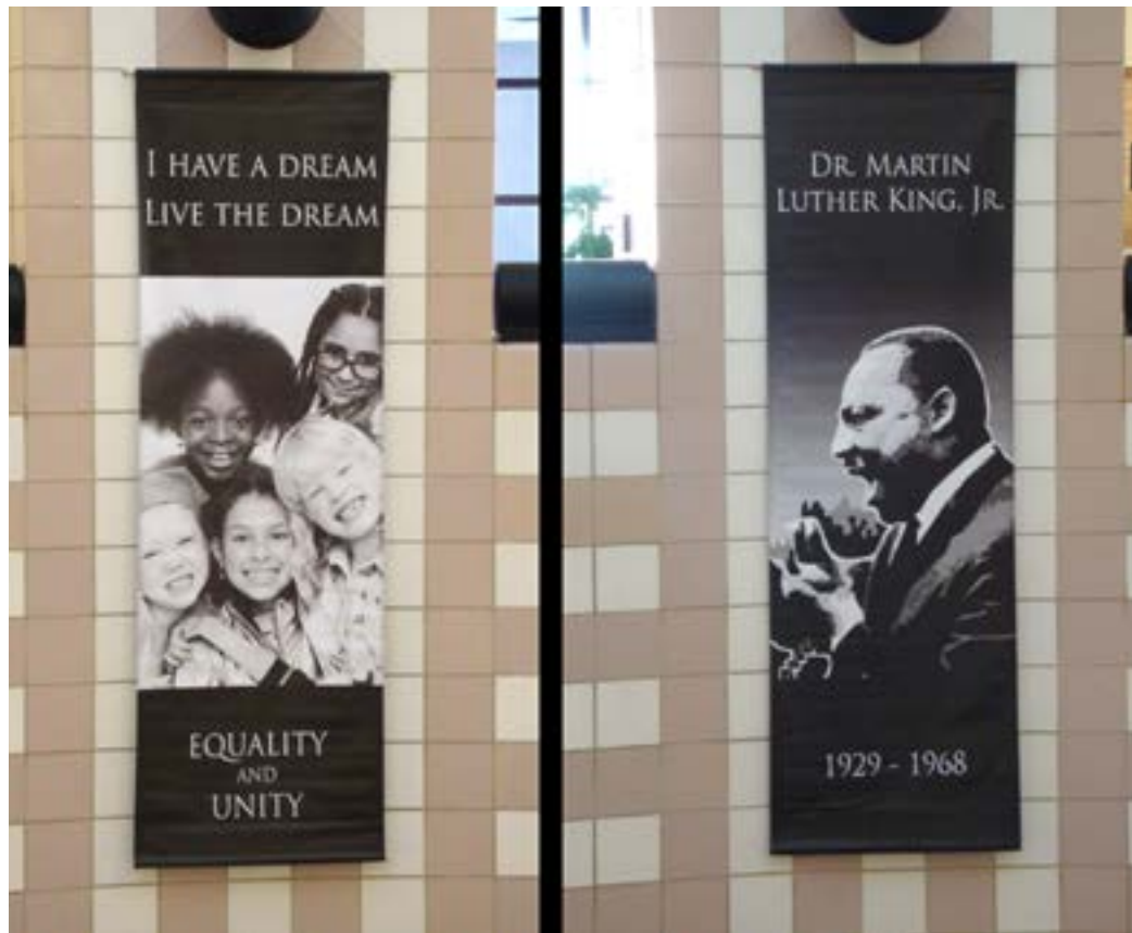
Special banners in Waldo Library for MLK celebration and Black History Month

The display is available for viewing when the Rare Book Room is open, 9 a.m. - 5 p.m., Monday - Friday on the third floor of Waldo Library. Banners hanging in the Waldo Library atrium pay