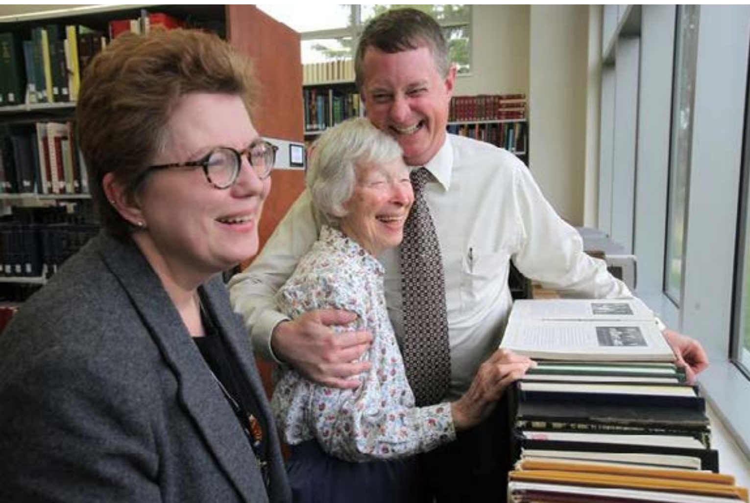
Family united after 92 years