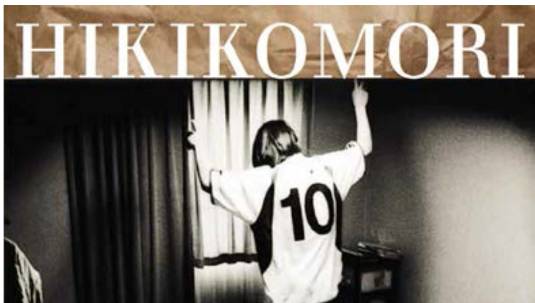
Cover of Hikikomori: Adolescence without End

Reviews of Hikikomori: Adolescence without End appear in a wide variety of journals, including the Times Higher Education Supplement, The New Inquiry and Mechademia. The publication was also discussed as part of an hour-long broadcast by the BBC on the issue of social withdrawal in Japan.