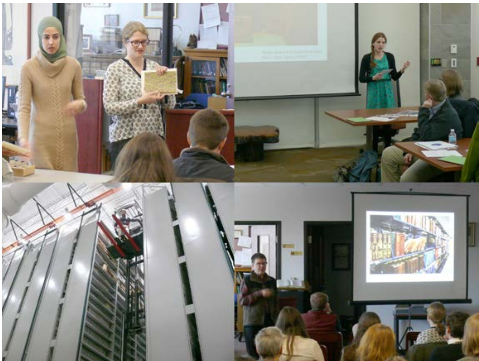
Collage of projects and activities at WMU's hosting of Conservation Care Camp