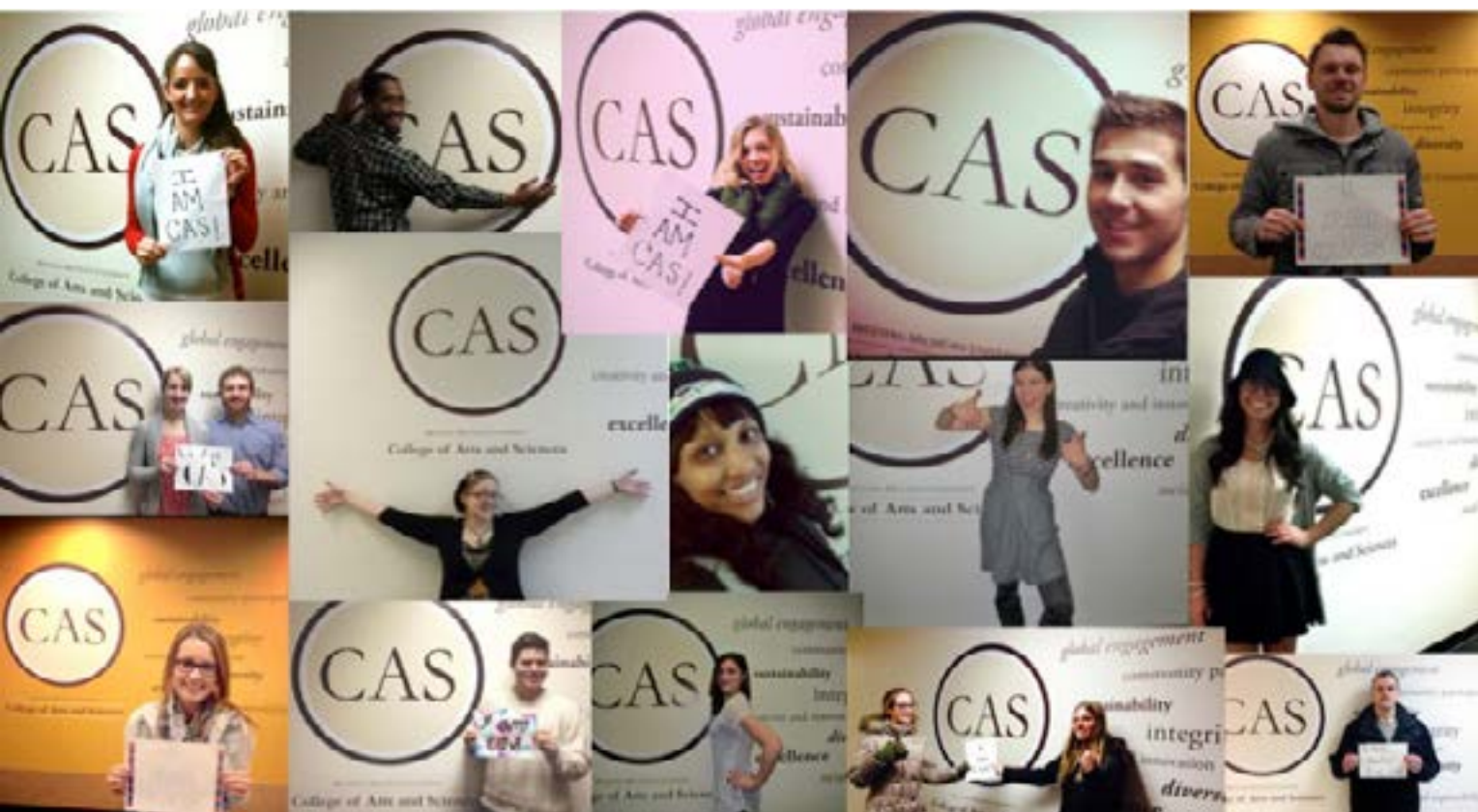
I Am CAS contest photos