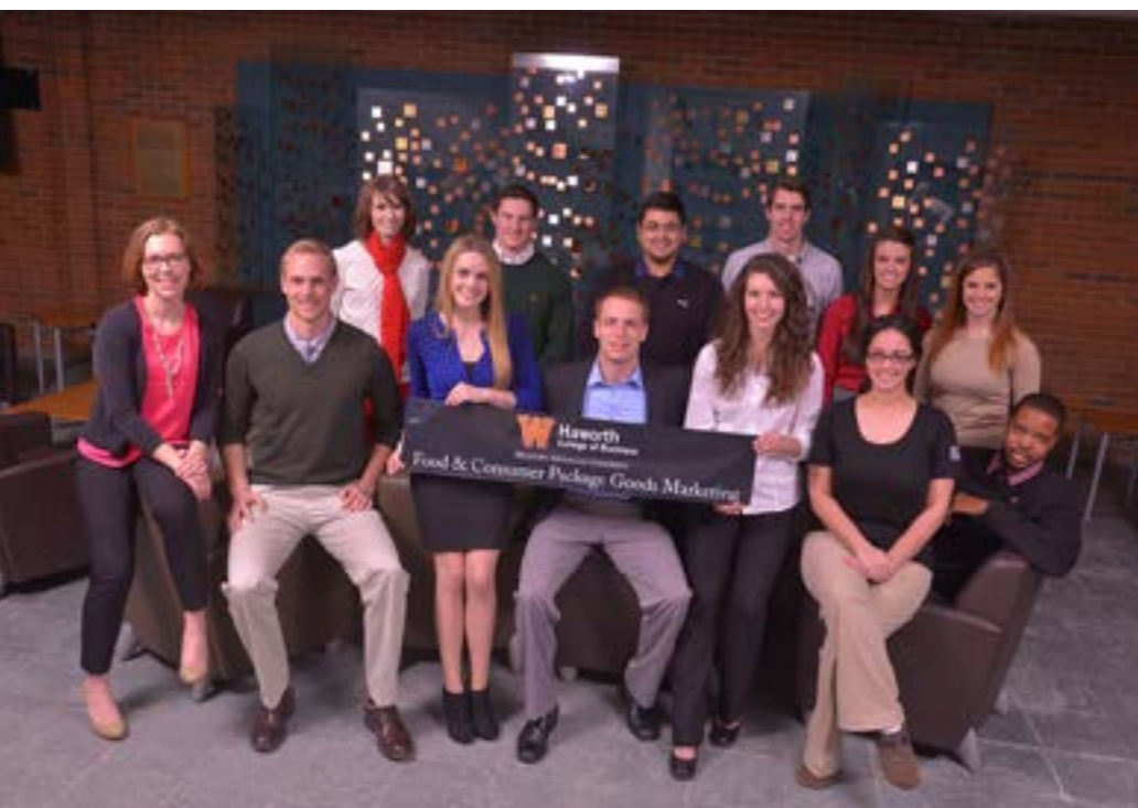
The team that contributed to the winning presentation