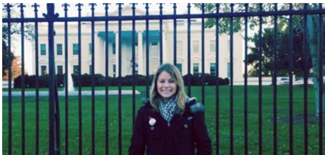
Holsworth wind scholarship to attend the Women, Law, and Legal Advocacy seminar