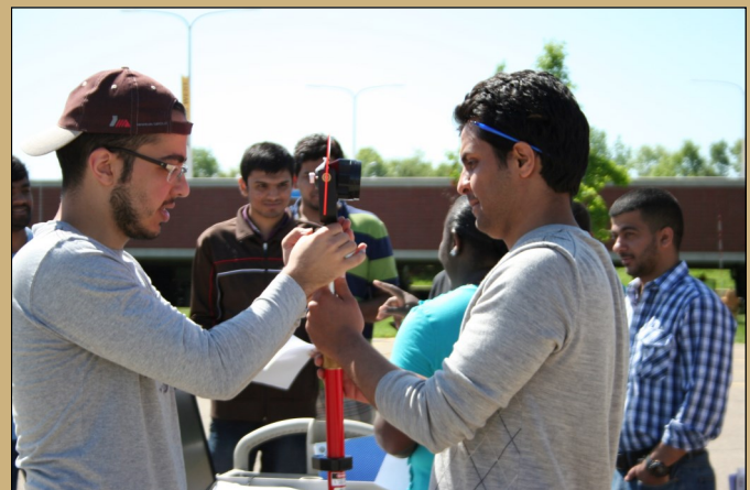
Students set up the equipment for the research activities.