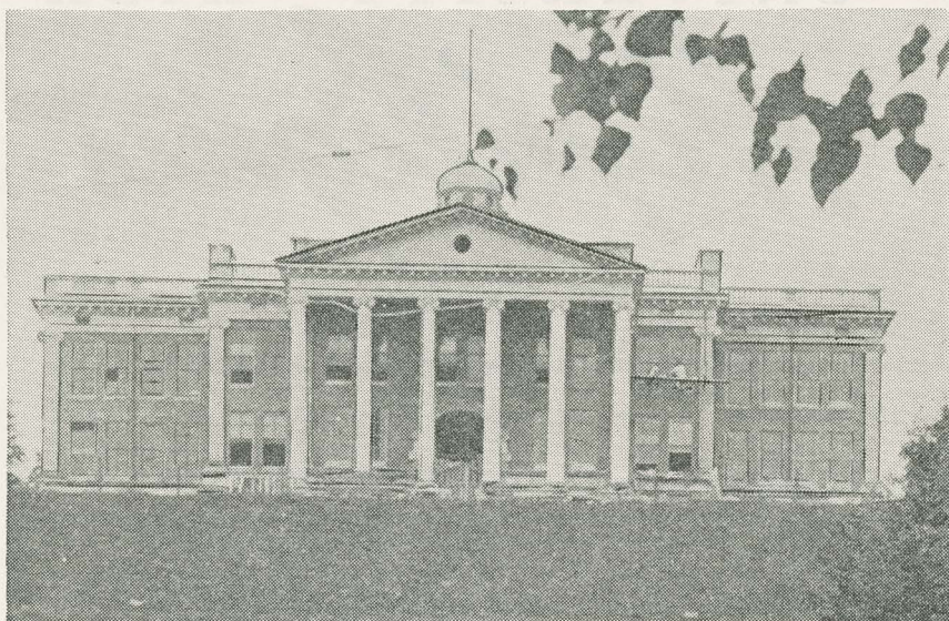
Administration Building, 1905