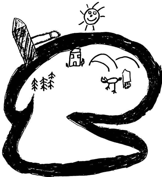
Figure 2 Illustration and text about Nicola's Island

my island is called Wales. It has trees a fox and houses and a lighthouse and a little bit of sand and mountains.