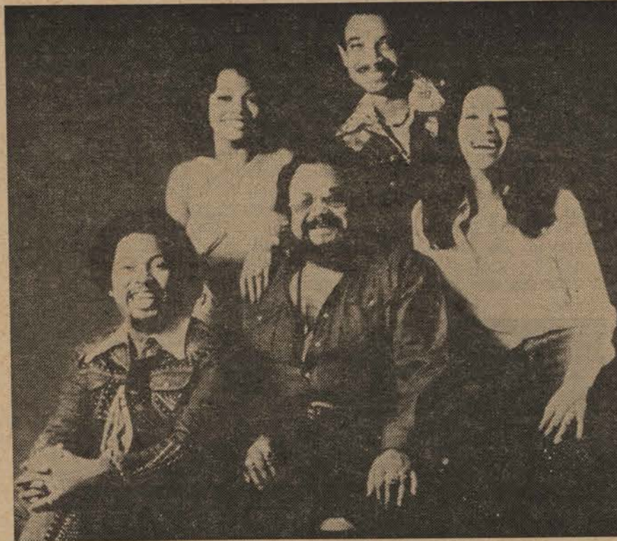
THE FIFTH DIMENSION, the popular recording group pictured above, will present two concerts at 7 and 10 p.m. Saturday, Feb. 1, here in Miller Auditorium. Tickets are still available for both shows.

Students who are thinking of going abroad with serious purpose in the next year or two are invited to attend and get some orientation in order to prepare themselves.