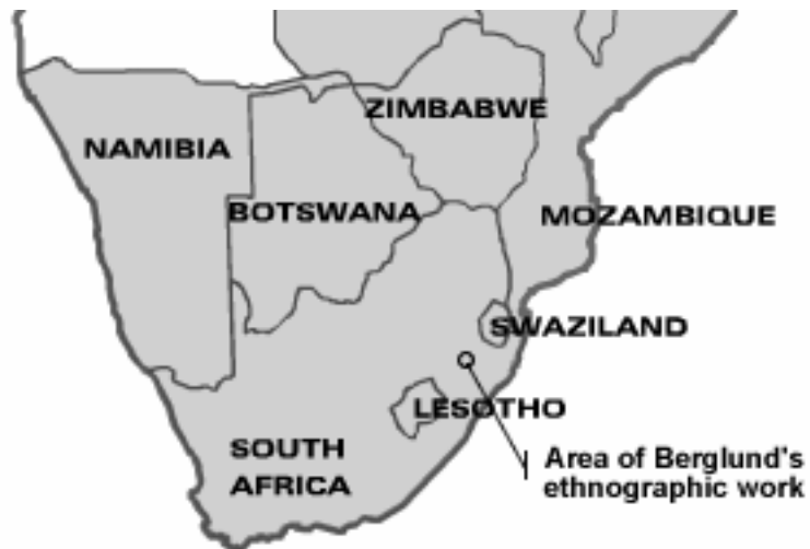
Figure 1 - Map of Southern Africa

Axel-Ivar Berglund, in his exhaustive ethnographic work Zulu Thought-Patterns and Symbolism , (1976) gives a detailed description of the events that surround the calling and initiation of a Zulu person as a diviner ( inyanga ) 3 . According to his informants, it is not the choice of a person (most of those “chosen” are women) to be a diviner but rather the choice of the “shades” or ancestors ( amadlozi ). Shades are the initiating agents and, therefore, play a fundamental role in the process of becoming a diviner.