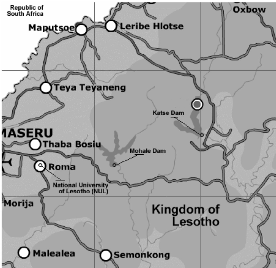
Figure 3 - Map Showing Mohale and Katse Dam Areas

social scientists, banks, investors, and governments hotly debate what the consequences of the project actually are. Numerous issues such as the treatment of workers, compensation of workers and displaced communities, geological and environmental effects, and corruption in the LHDA (Lesotho Highlands Development Authority), World Bank, and governments of Lesotho and South Africa have had an impact on the project.