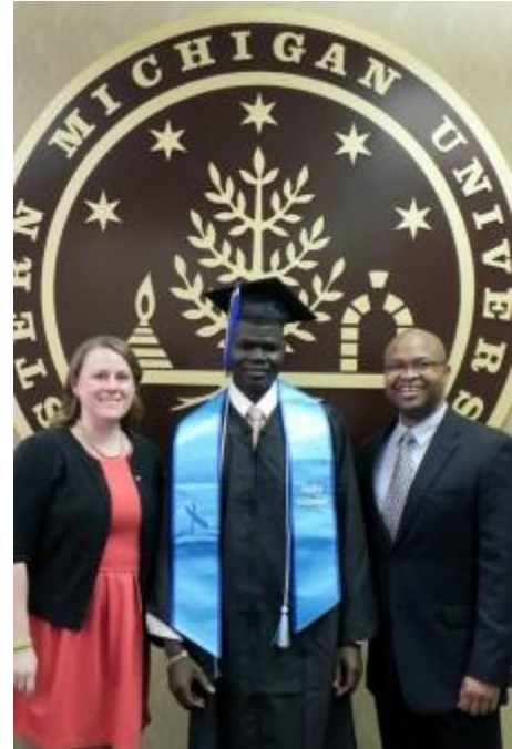
Fostering Success Michigan includes the well-known Seita Scholars Program.

Fostering Success Michigan focuses on developing resources to reach and support students through professionals and organizations in its network. The organization has defined and targets five regions that cover the state of Michigan. In each region, network partners, ranging from caregivers and foster youth to school districts, social service organizations and colleges, meet regularly to share information. And once each year, a statewide summit brings network members together to share information more broadly.