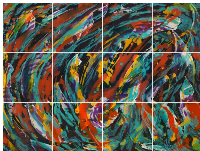
Figure 2. “Sunlight underwater” by Alli Berman

paint swirls can be traced with the eyes, fingers, and arms. Children and adults alike enjoy searching for the hundreds of hidden pictures concealed in each painting. Special PuzzleArt 3D glasses encourage the eyes to work together as a coordinated team.