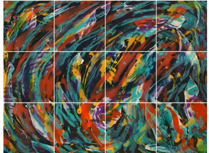
Figure 2. “Sunlight underwater” by Alli Berman

paint swirls can be traced with the eyes, fingers, and arms. Children and adults alike enjoy searching for the hundreds of hidden pictures concealed in each painting. Special PuzzleArt 3D glasses encourage the eyes to work together as a coordinated team.