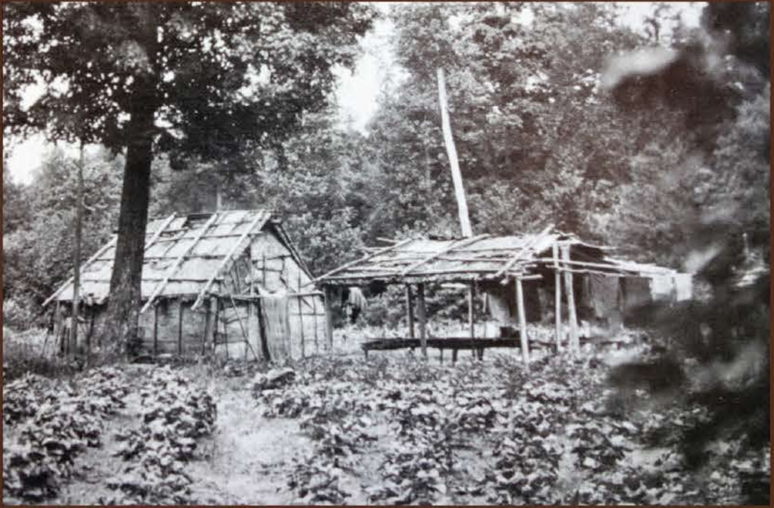
▲ Potawatomi summer houses were much larger than winter homes. Summer houses were built with a rectangular frame of saplings, covered with elm bark, and had an arched roof or could be a large domed shaped wigwam. From Native American Architecture by Peter Nabokov and Robert Easton.

Construction Methods –The Potawatomis lived in portable shelters covered in light-weight waterproof mats during late fall, winter, and early spring, and spent the warmer months in permanent bark covered summer houses. Native peoples followed a precise cycle of movements within their homeland to take advantage of the seasonal availability of resources. When they moved, they carried the mats from one house and placed them on the other. While traveling between seasonal camps, personal belongings were rolled inside of the mats.