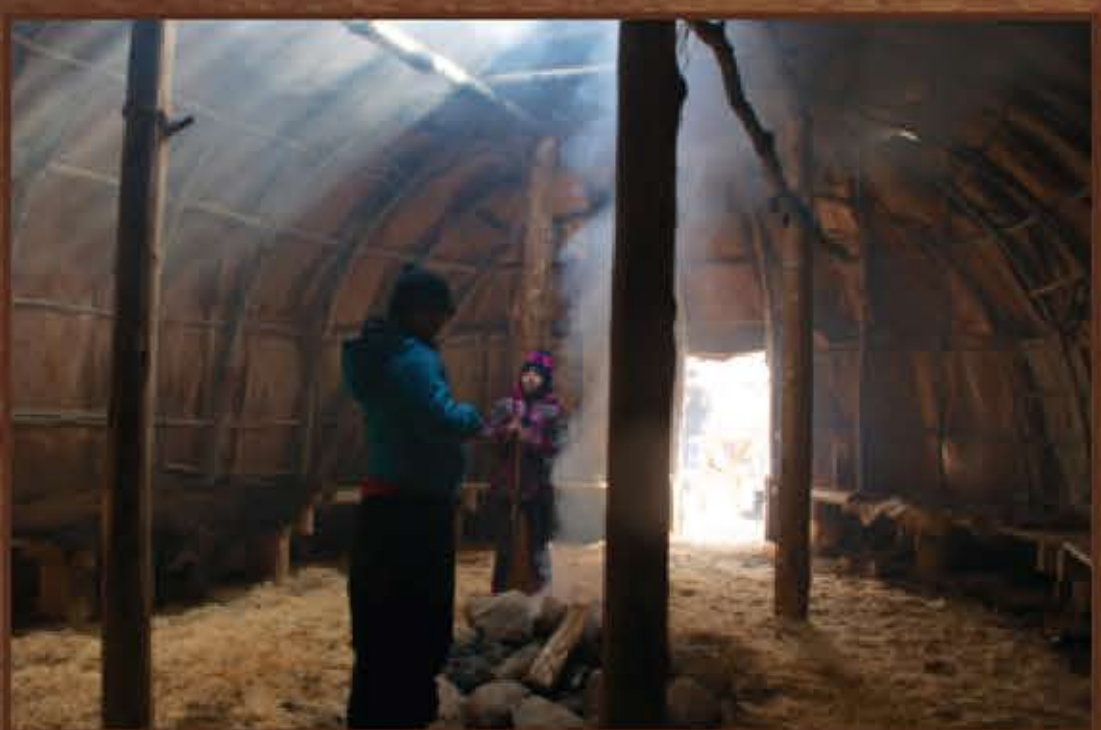
▲ Interior of a contemporary elm bark covered wigwam.

Their portable structures were easy to assemble, dismantle, and transport, making them efficient and effective shelters. These buildings are hard to identify archaeologically because they left few traces on the landscape. Evidence consists of some archaeological remains of house floors, historical records, and oral accounts from members of the Potawatomi Tribe.