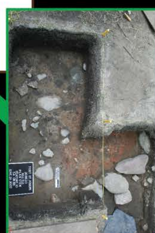
▲ This figure illustrates the outlines of two possible structures found at Fort St. Joseph. The artifacts found in association with each structure indicate that they were most likely homes of fur traders at the fort.

Top: An ash pit suggesting that a window may have been located here in which ash from the fireplace was thrown out.