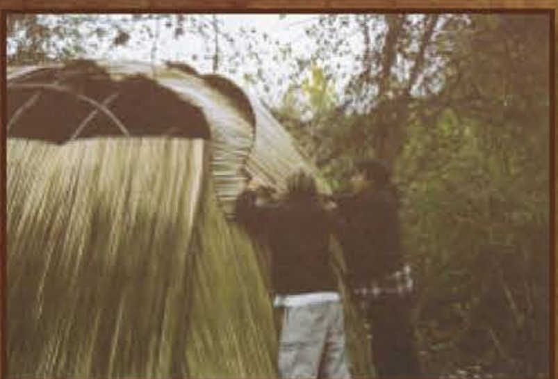
▲ Assembling a pek-ye-gan , a mat covered winter house, 2001.

Their portable structures were easy to assemble, dismantle, and transport, making them efficient and effective shelters. These buildings are hard to identify archaeologically because they left few traces on the landscape. Evidence consists of some archaeological remains of house floors, historical records, and oral accounts from members of the Potawatomi Tribe.