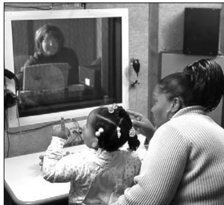
The Carls Foundation gift will increase direct services provided through the Van Riper Language, Speech and Hearing Clinic.